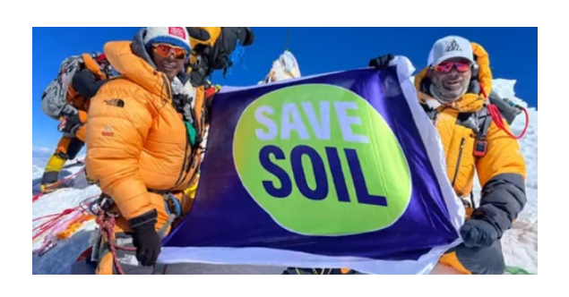
Mountaineer Sunil Nataraj reached the #Everest base camp in a record time of 24:03.