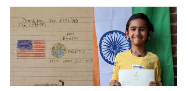
US President Joe Biden replied to a young and eager Earth Buddy's #SaveSoil letter.

Many people across the world were so touched by the movement that they have made it their own. In their own unique ways, each of them is amplifying the Save Soil message. Here are some outstanding examples of such efforts: